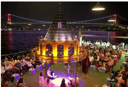
Bosphorus Dinner Cruise