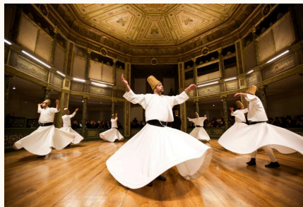
Dervish Dance Show